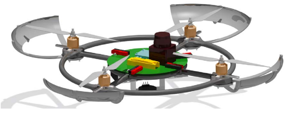
Figure 2 - MAAVerick Structure and Electronics