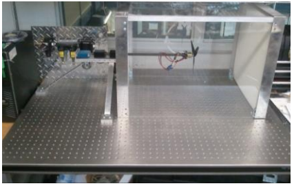
Figure 8: Motor test cell

Calibration is required for each motor/speed-controller/propeller triad. Motor/speed-controller/propeller calibration curves mapping RPM to force are calculated using the MAAV Test Cell shown in Figure 8 . The test cell is equipped with an air bearing, force and torque transducers, and a data acquisition system (DAQ). The test cell automatically collects relevant data for each motor/speed-controller/propeller combination.