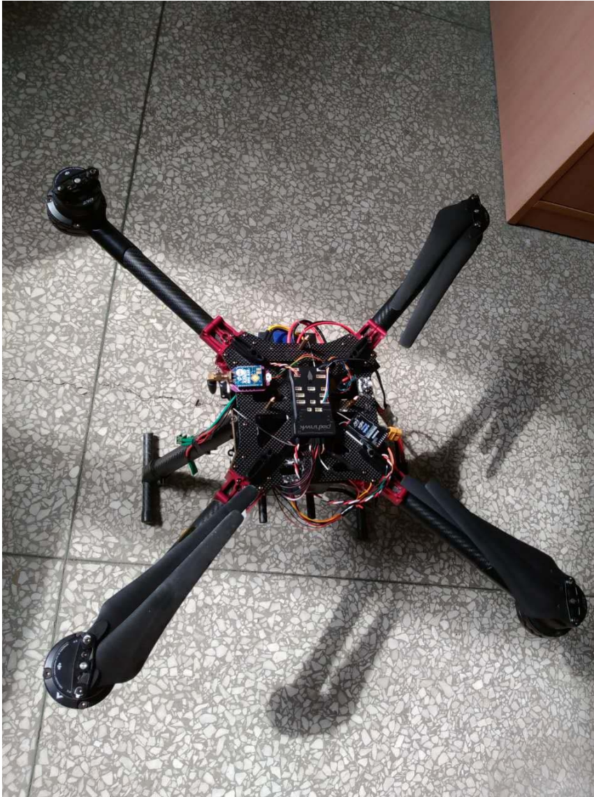
Figure 2. Flight platform of THBOT